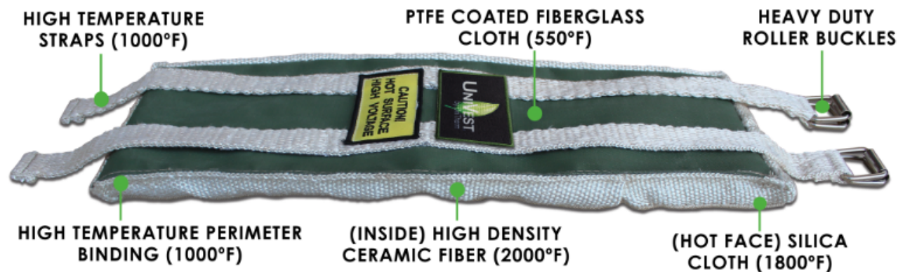
UniVest® equipment insulation jacket construction.

drool or blow-back from reaching insulation jackets, heater bands, and wires. Plastic drool collects on the shield instead of damaging or destroying your investments. DroolShield® withstands temperatures up to 700°F (370°C), making them a reusable, long-term solution for blow back at an affordable price.